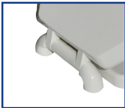
External check hinge with 304 stainless steel hinge posts