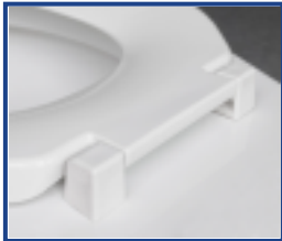
External check hinge with stainless steel hinge posts