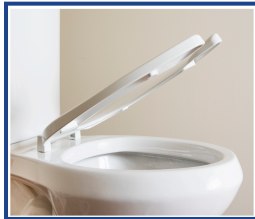
External self sustaining check hinge holds seat 45 degrees before vertical to minimize slamming