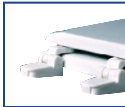
Factory-installed "living" hinge covers with stainless steel screws