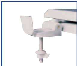
Corrosion proof, self aligning hardware