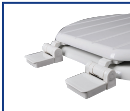
Factory-installed "living" hinge covers with stainless steel screws