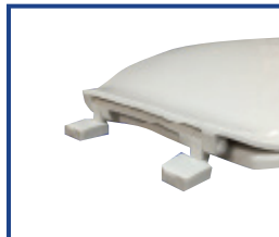
Factory-installed "living" hinge covers