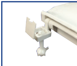
Corrosion proof, self aligning hardware