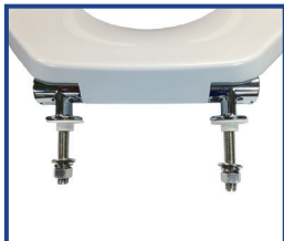
External check hinge with coated metal hinge posts