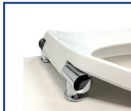
Chrome finish metal slow close hinges