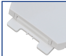
Factory-installed "living" hinge covers