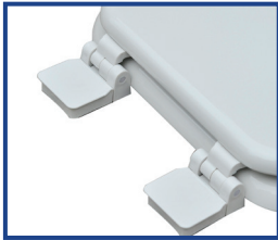
Factory-installed hinge with stainless steel screws