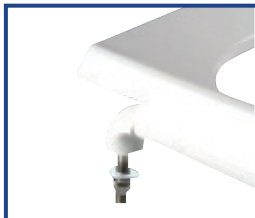
External check hinge with 304 stainless steel hinge posts