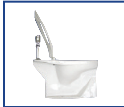
External self sustaining check hinge holds seat 45 degrees before vertical to minimize slamming