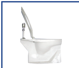
External check hinge stops seat 11 degrees beyond vertical to minimize damage to flush valve