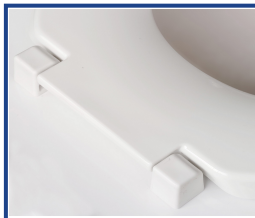
External check hinge with non-corrosive hinge posts