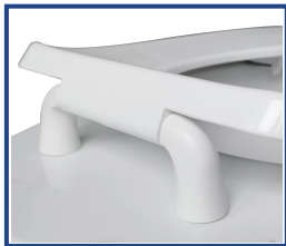
External check hinge with 304 stainless steel hinge posts