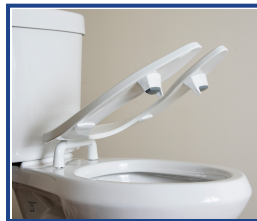
External self sustaining check hinge holds seat 45 degrees before vertical to minimize slamming