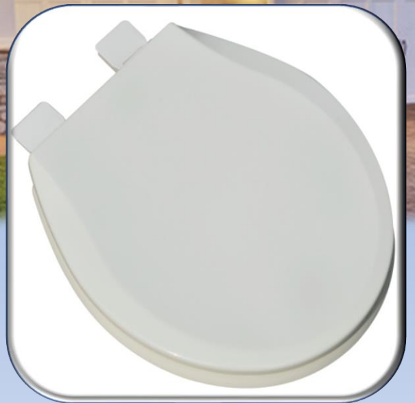
Model 125 Round