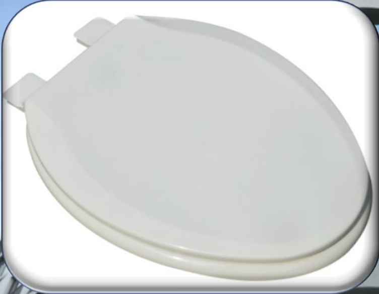
PLUMBTECH Model 126-00 Premium Elongated Molded Wood Seat. Suggested List: $33.00