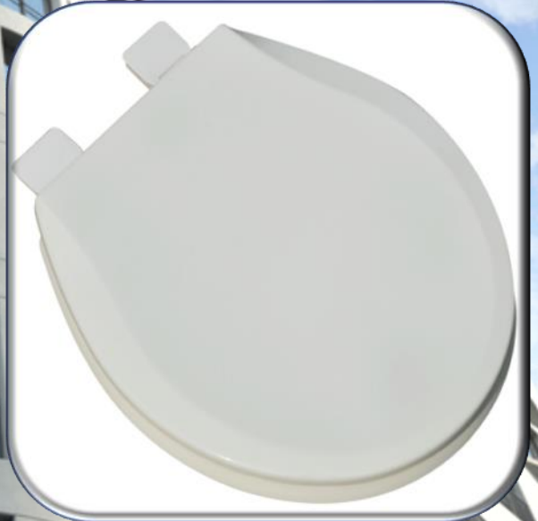
PLUMBTECH Model 125-00 Premium Round Front Molded Wood Seat. Suggested List: $23.00