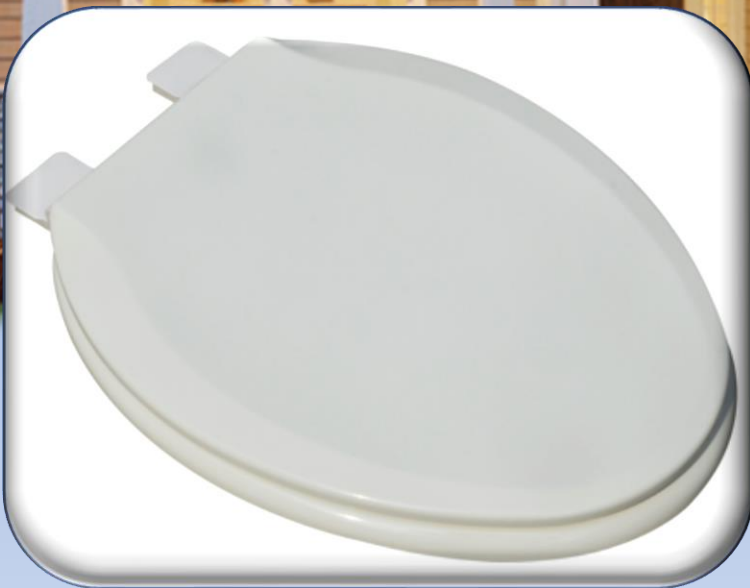
Model 126 Elongated