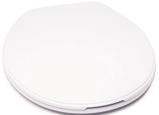
PLUMBTECH Model 212-00. Round Front Plastic Suggested List: $29.00