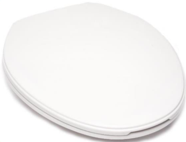
PLUMBTECH Model 213-00. Elongated Plastic Suggested List: $39.00