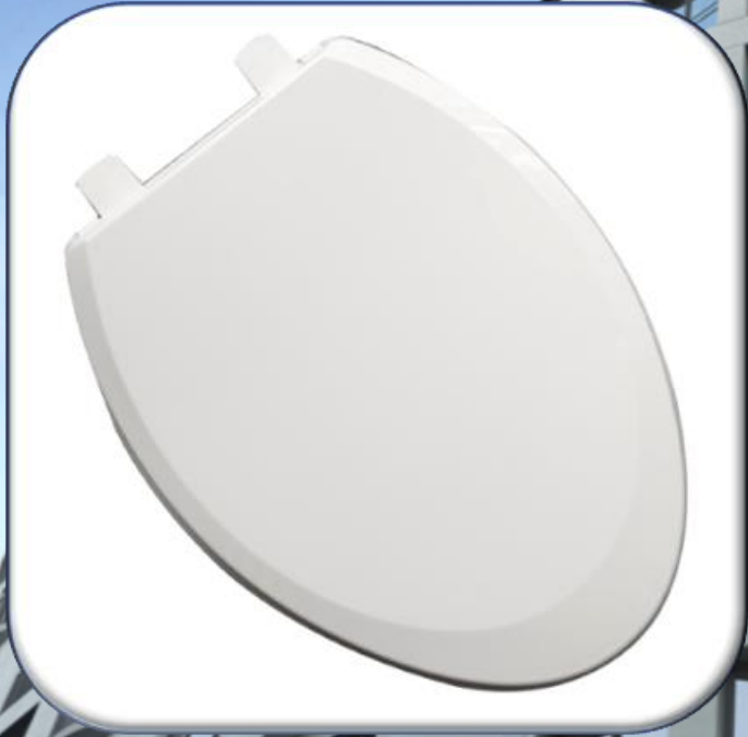
PLUMBTECH Model 225-00. Elongated Plastic Slow Close Suggested List: $35.00