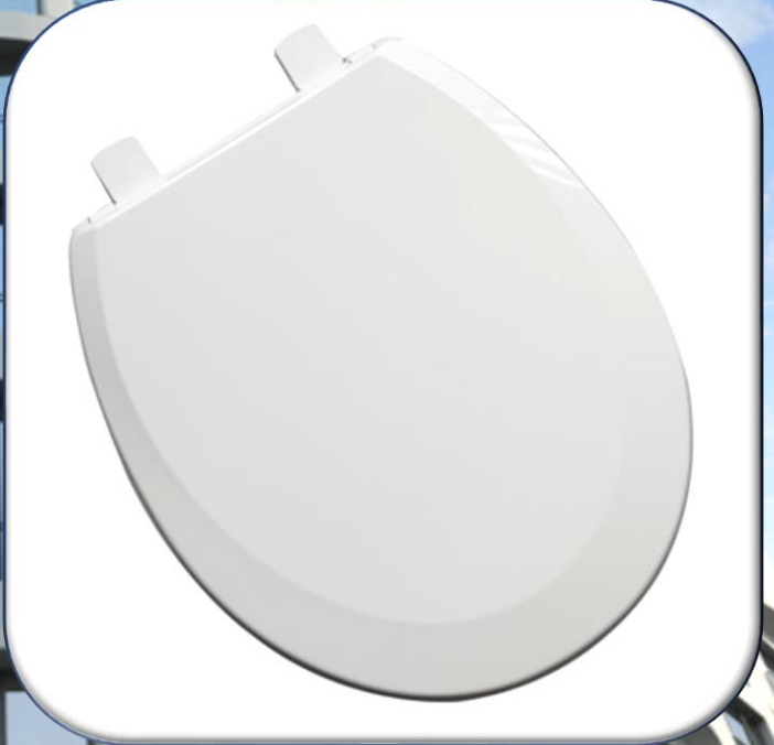
PLUMBTECH Model 224-00. Round Front Plastic Slow Close Suggested List: $30.00