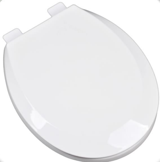
PLUMBTECH Model 230-00. Round Front Plastic Suggested List: $85.00