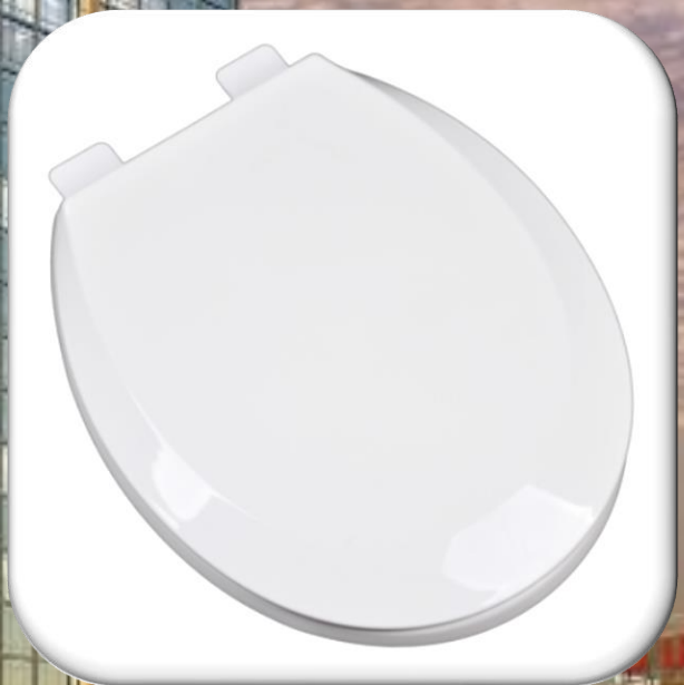
Model 230 Round