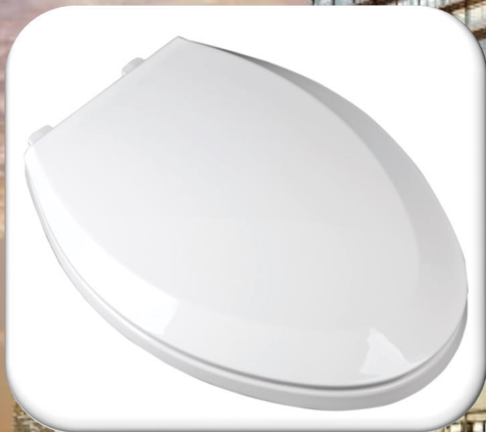
Model 231 Elongated