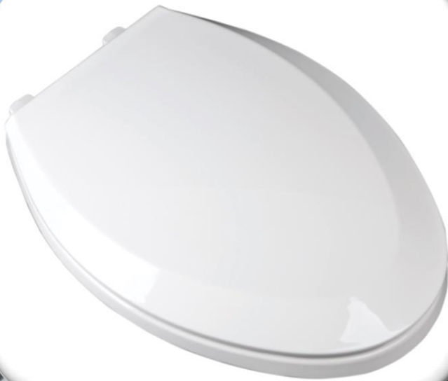
PLUMBTECH Model 231-00. Elongated Plastic Suggested List: $90.00