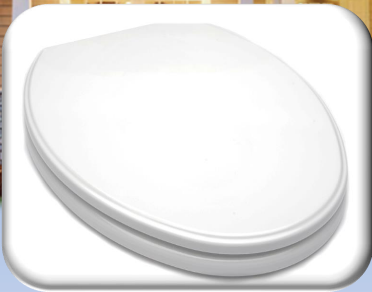
Model 144 Elongated