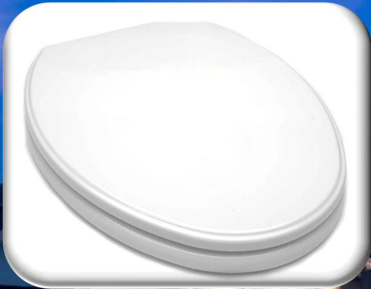
PLUMBTECH Model 144-00 Slow Close Elongated Molded Wood Seat.