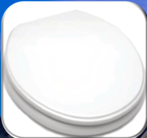
PLUMBTECH Model 143-00 Slow Close Round Front Molded Wood Seat.