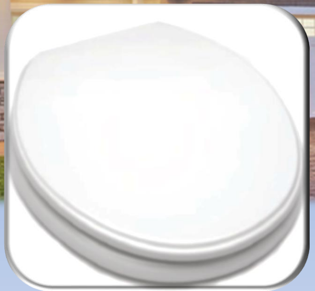
Model 143 Round