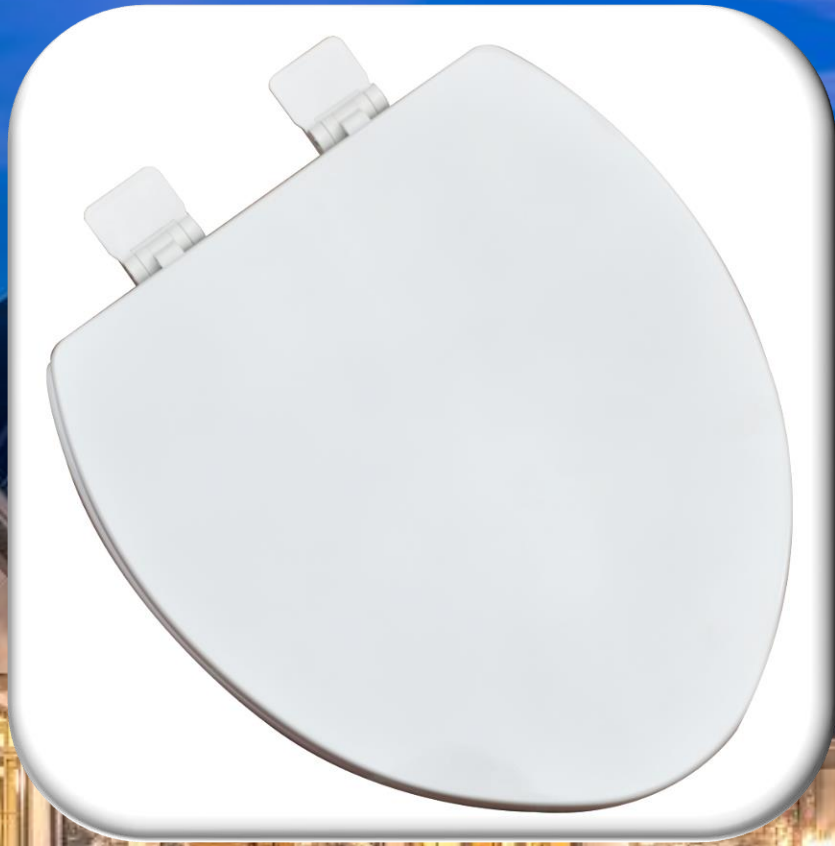
PLUMBTECH Model 193-00 Premium Oversized Molded Wood Seat. Suggested List: $63.00