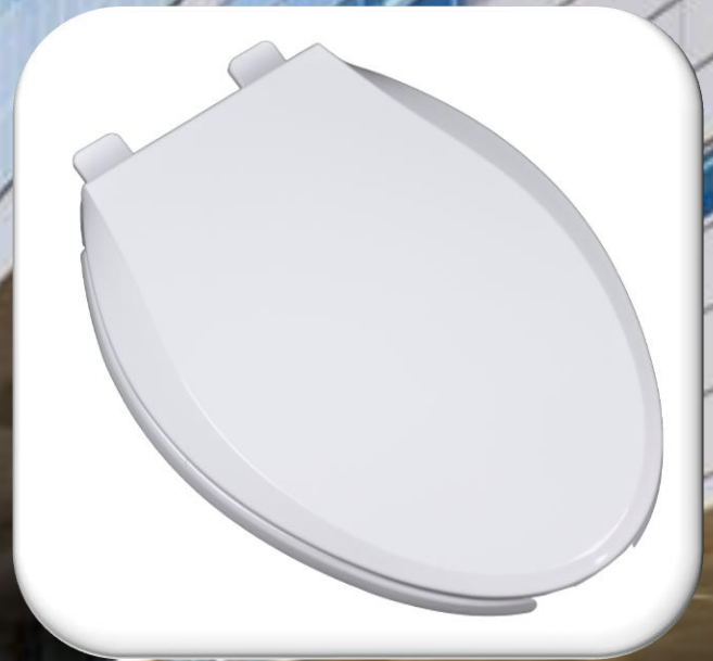
Model 371 Elongated Open Front