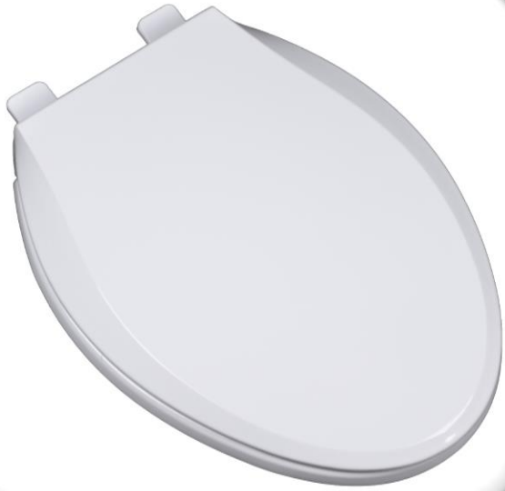
PLUMBTECH Model 271 Heavy Duty Commercial Elongated-Slow Close- Closed Front. Suggested List: $69.00