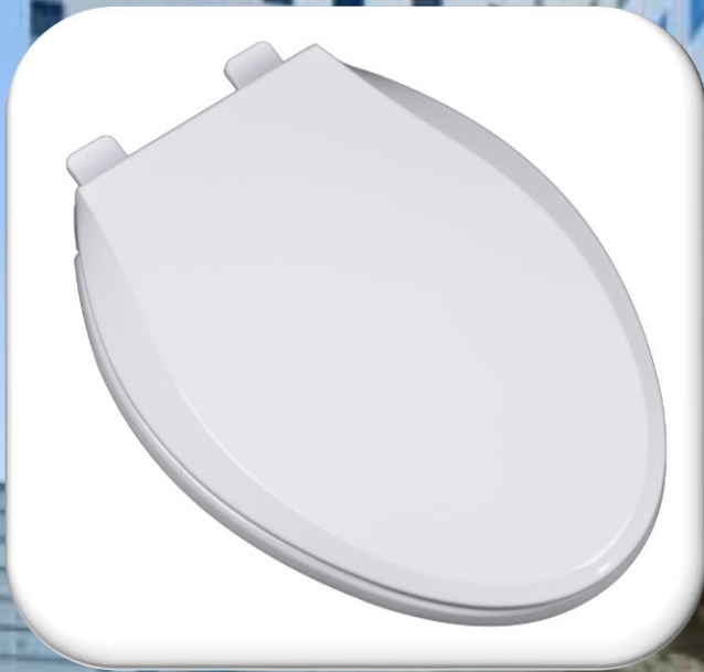
Model 271 Elongated Closed Front