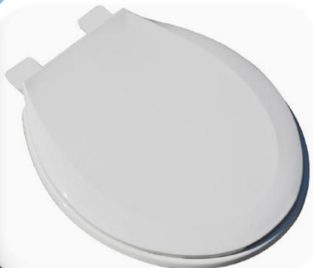
PLUMBTECH Model 205-00. Round Front Plastic Suggested List: $25.00