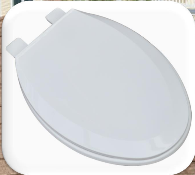
Model 206 Elongated