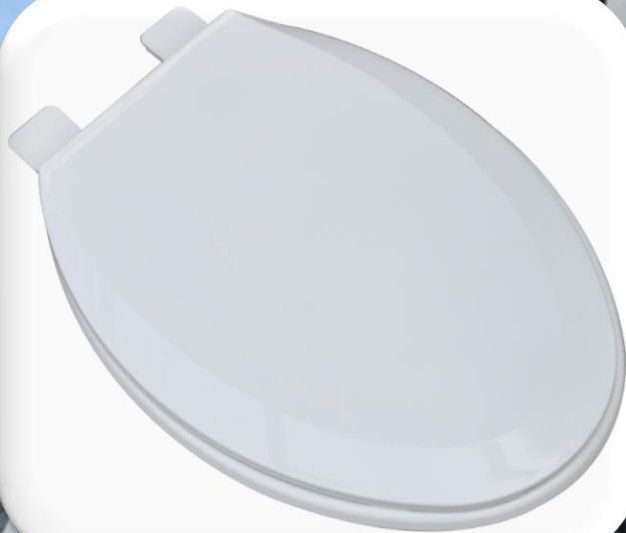
PLUMBTECH Model 206-00. Elongated Plastic Suggested List: $30.00