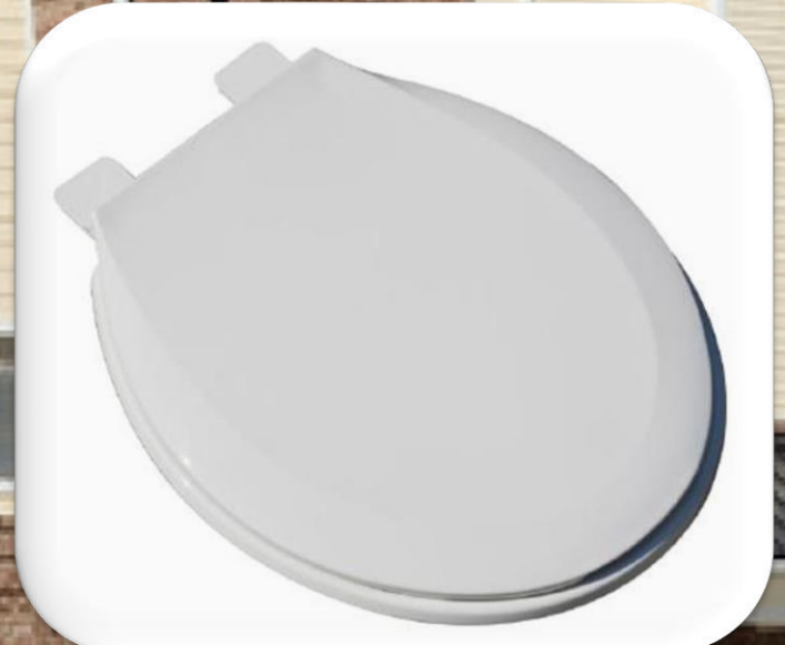
Model 205 Round