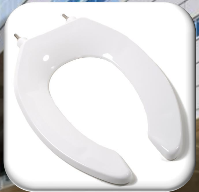
Model 421SSC Elongated