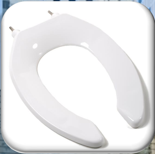
Model 421C Elongated