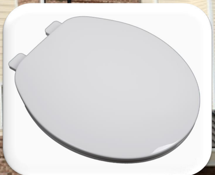
Model 210 Round