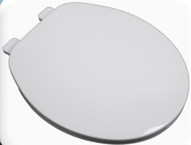
PLUMBTECH Model 210-00. Round Front Plastic Suggested List: $28.00