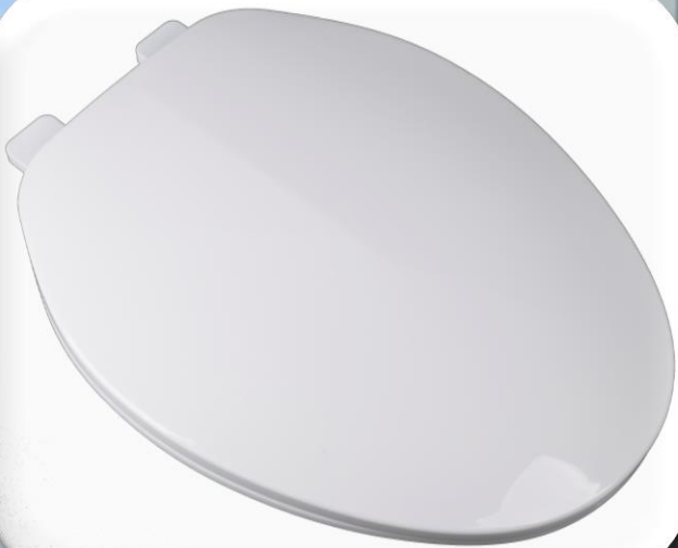
PLUMBTECH Model 211-00. Elongated Plastic Suggested List: $30.00