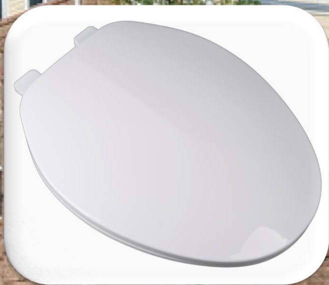
Model 211 Elongated