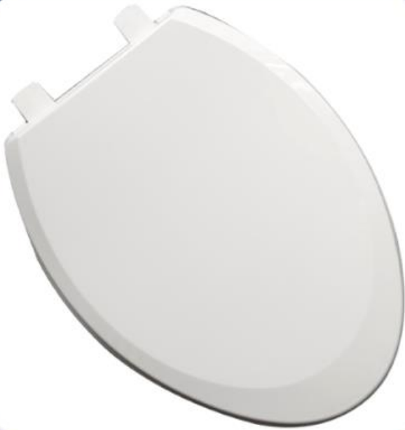
PLUMBTECH Model 225-00. Elongated Plastic Slow Close Suggested List: $35.00