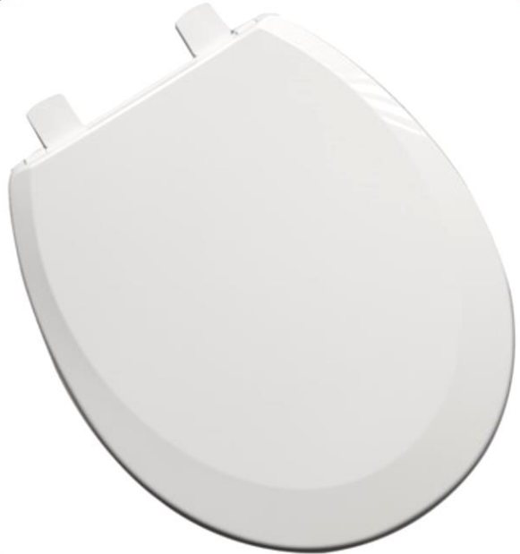
PLUMBTECH Model 224-00. Round Front Plastic Slow Close Suggested List: $30.00