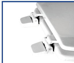
Factory-installed "living" hinge covers