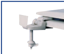
Corrosion proof, self aligning hardware