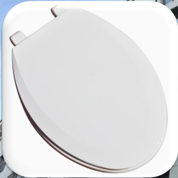
PLUMBTECH Model 204-00. Elongated Plastic Suggested List: $31.00