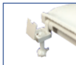
Corrosion proof, self aligning hardware