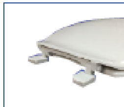
Factory-installed "living" hinge covers