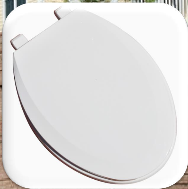
Model 204 Elongated