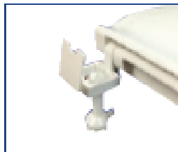
Corrosion proof, self aligning hardware