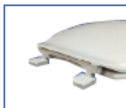
Factory-installed "living" hinge covers