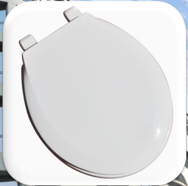
PLUMBTECH Model 203-00. Round Front Plastic Suggested List: $21.00