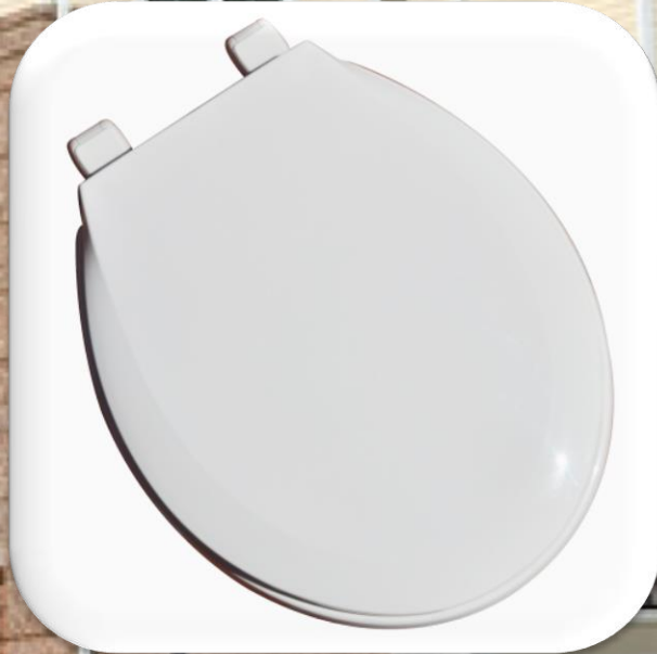
Model 203 Round