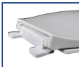
Factory-installed "living" hinge covers