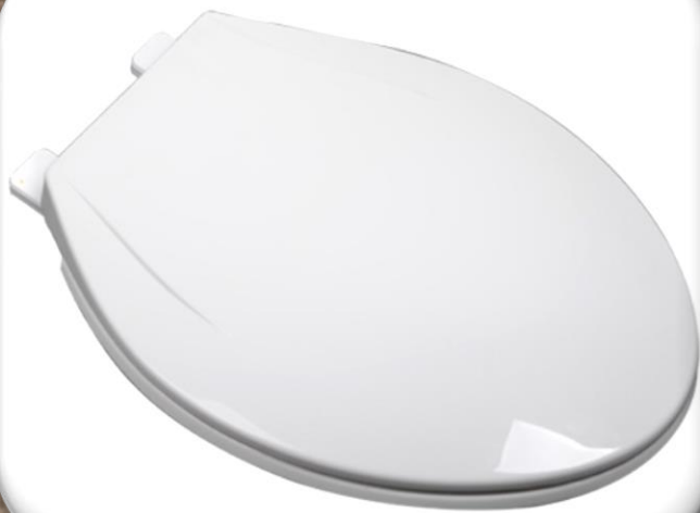
Model 241 Elongated