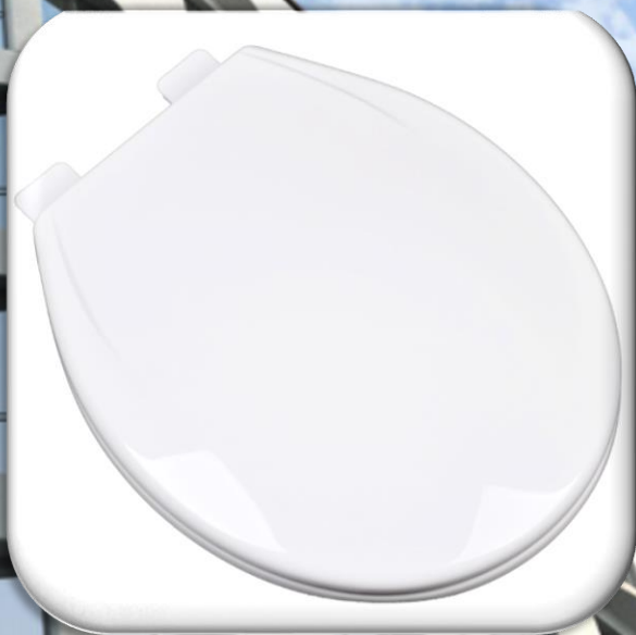
PLUMBTECH Model 240 Round Front Plastic Slow Close Suggested List: $34.00