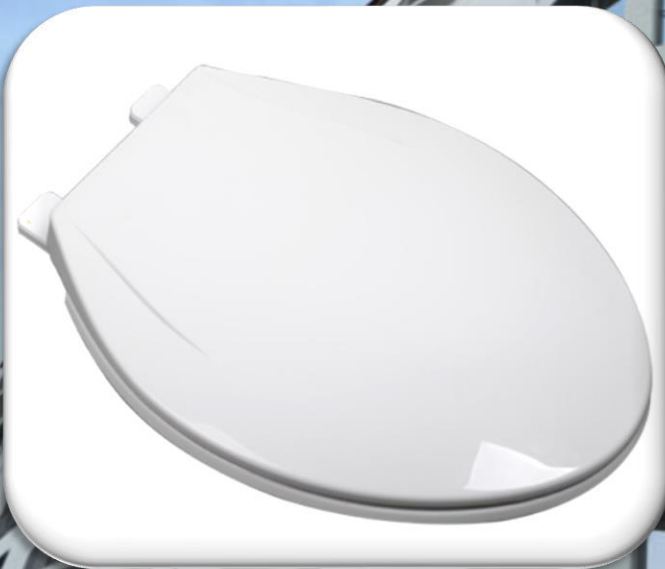
PLUMBTECH Model 241 Elongated Plastic Slow Close Suggested List: $40.00