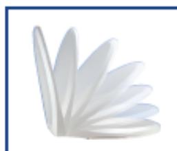
Slow Close Seat