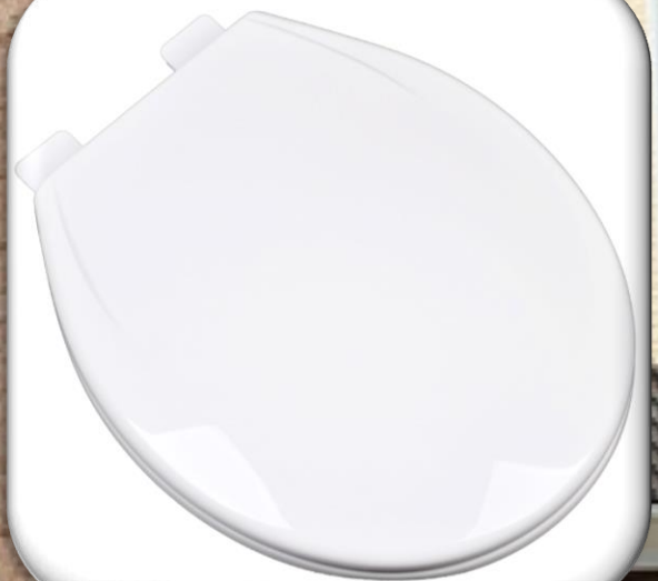
Model 240 Round