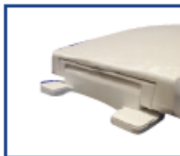
Factory-installed "living" hinge covers with stainless steel screws