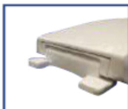
Factory-installed "living" hinge covers