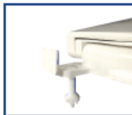
Corrosion proof, self aligning hardware