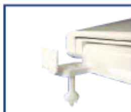
Corrosion proof, self aligning hardware