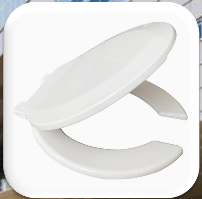
Model 320 Round