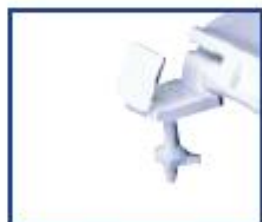
Corrosion proof, self aligning hardware