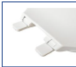
Factory-installed "living" hinge cover