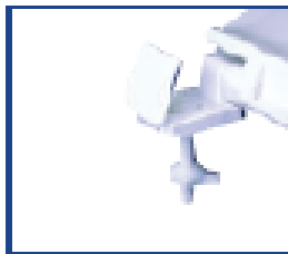
Corrosion proof, self aligning hardware