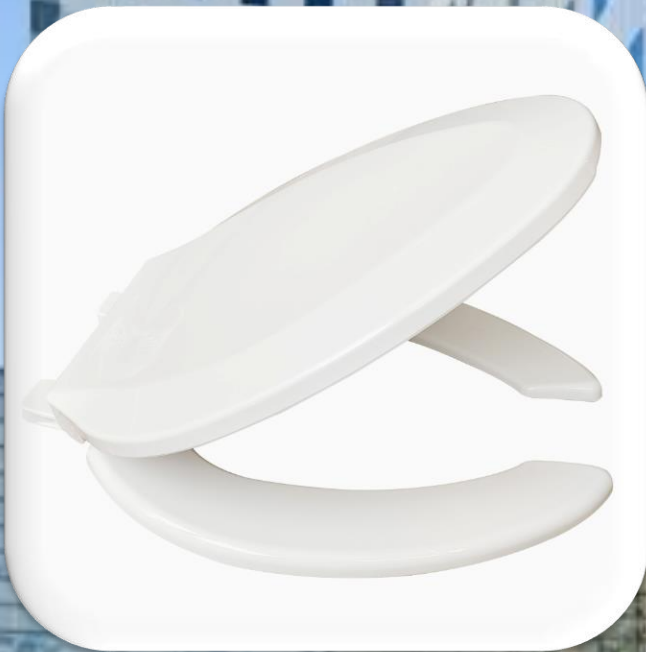
Model 321 Elongated