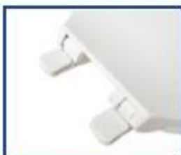
Factory-installed "living" hinge covers