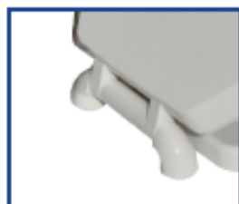
External check hinge with 304 stainless steel hinge posts