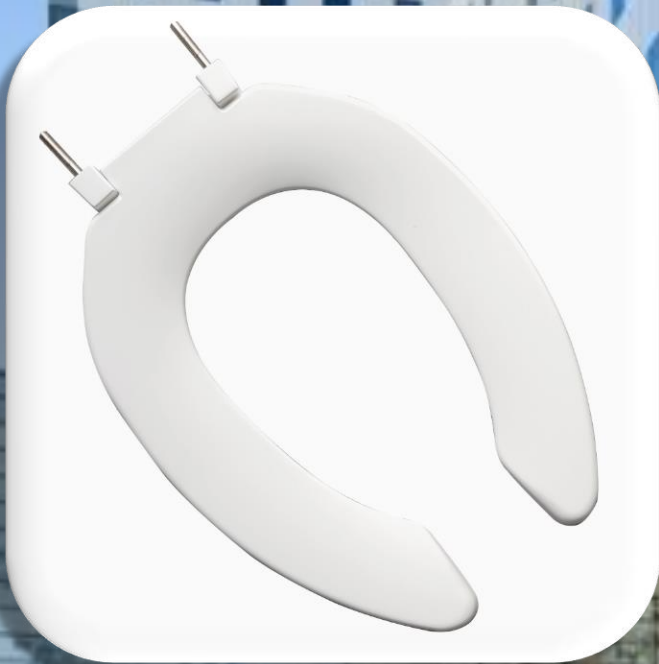
Model 407CC Elongated