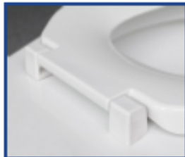
External check hinge with stainless steel hinge posts