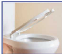
External self sustaining check hinge holds seat 45 degrees before vertical to minimize slamming