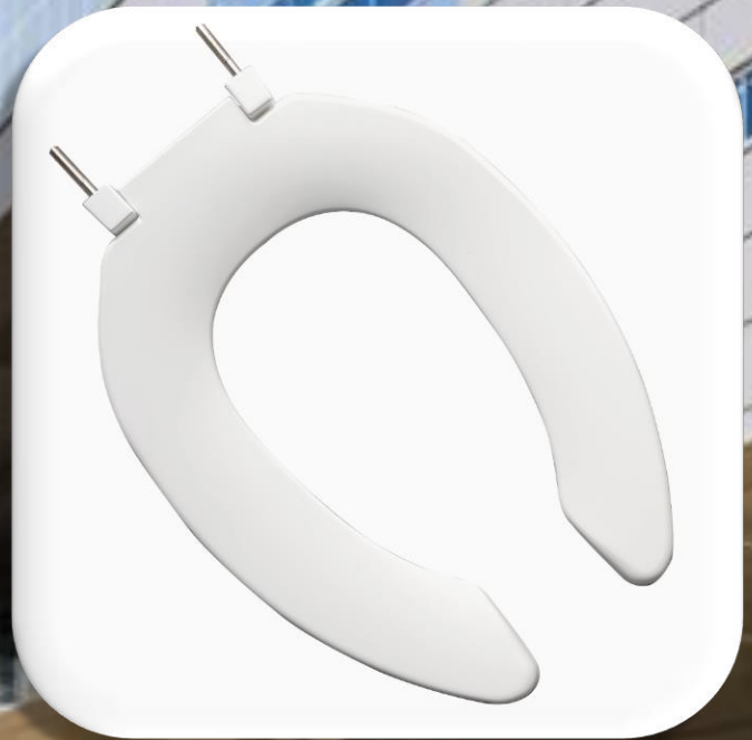
Model 407SSC Elongated