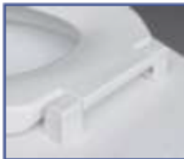
External check hinge with stainless steel hinge posts