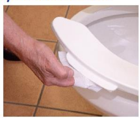
Use A Piece Of Tissue

Models 423C & 423SSC are available in White only.