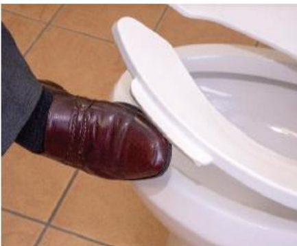
Use Right Foot

Lift Handles - easily lift the seat with the side of your shoe or tissue