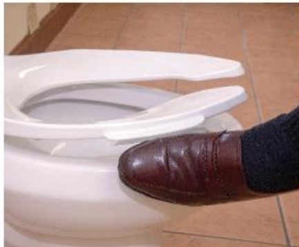
Use Left Foot