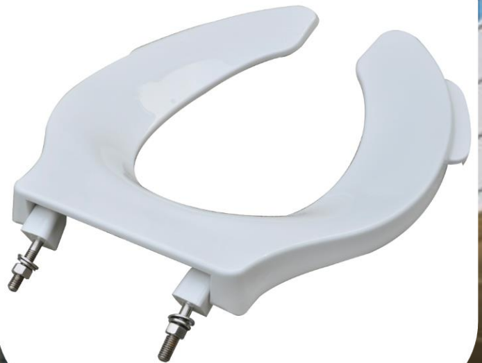
Model 423SSC Elongated