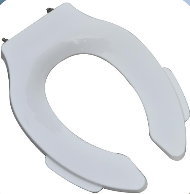
Model 423C Elongated