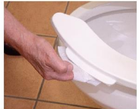
Use A Piece Of Tissue

Models 423C & 423SSC are available in White only.