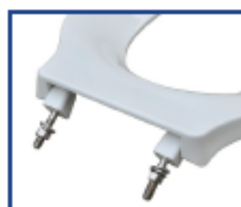
External check hinge with 304 stainless steel hinge posts