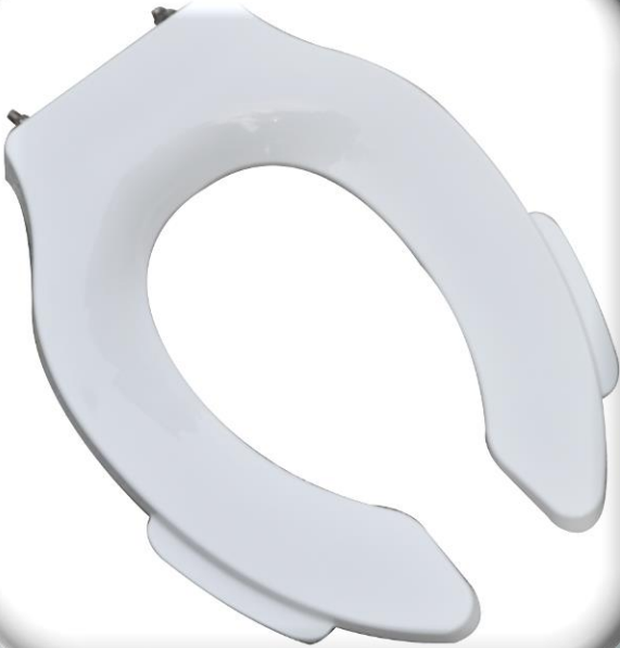
PLUMBTECH Model 423C Elongated Plastic Commercial Seat Suggested List: $47.00