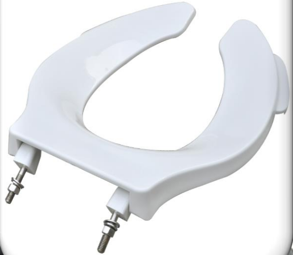
PLUMBTECH Model 423SSC Elongated Plastic Commercial Seat with Self-Sustaining Suggested List: $63.00