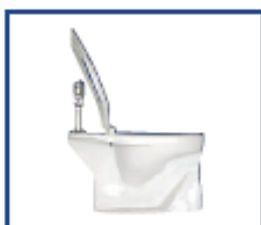
External self sustaining check hinge holds seat 45 degrees before vertical to minimize slamming