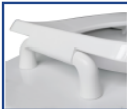
External check hinge with 304 stainless steel hinge posts