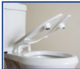
External self sustaining check hinge holds seat 45 degrees before vertical to minimize slamming