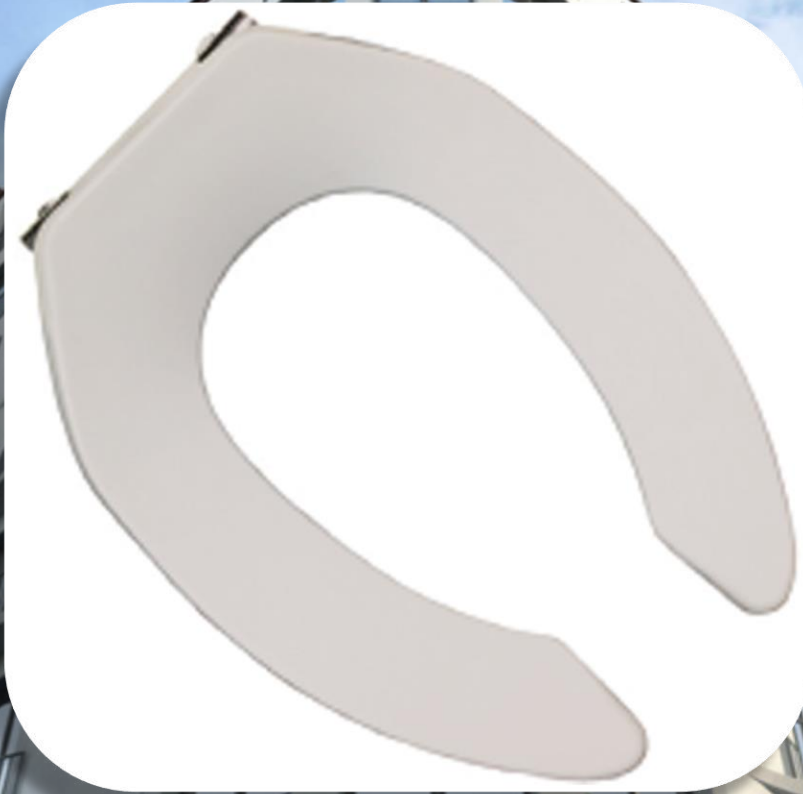
PLUMBTECH Model 451C Slow Closing Heavy Duty Elongated Plastic Commercial Seat Suggested List: $50.00