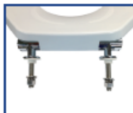
External check hinge with coated metal hinge posts