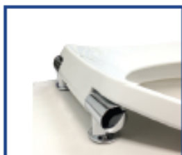
Chrome finish metal slow close hinges