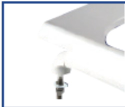
External check hinge with 304 stainless steel hinge posts