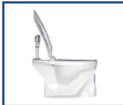
External check hinge stops seat 11 degrees beyond vertical to minimize damage to flush valve