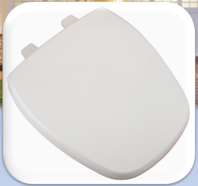
Model 187 Round