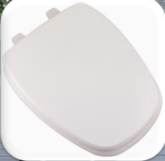
PLUMBTECH Model 188-00 Premium Elongated Wood Seat. Suggested List: $39.00