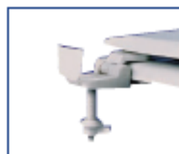
Corrosion proof, self aligning hardware