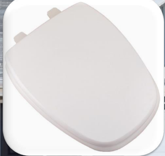
PLUMBTECH Model 187-00 Premium Round Front Wood Seat. Suggested List: $45.00