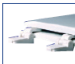
Factory-installed "living" hinge covers with stainless steel screws