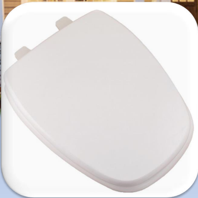
Model 188 Elongated