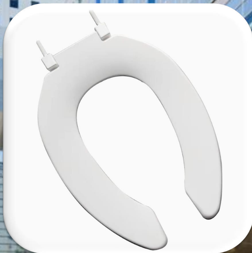
Model 403C Elongated