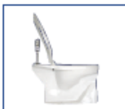
External check hinge stops seat 11 degrees beyond vertical to minimize damage to flush valve