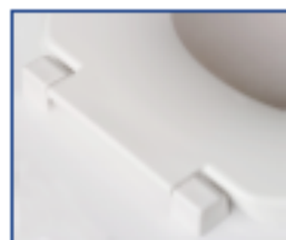
External check hinge with non-corrosive hinge posts