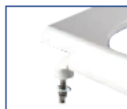
External check hinge with coated metal hinge posts