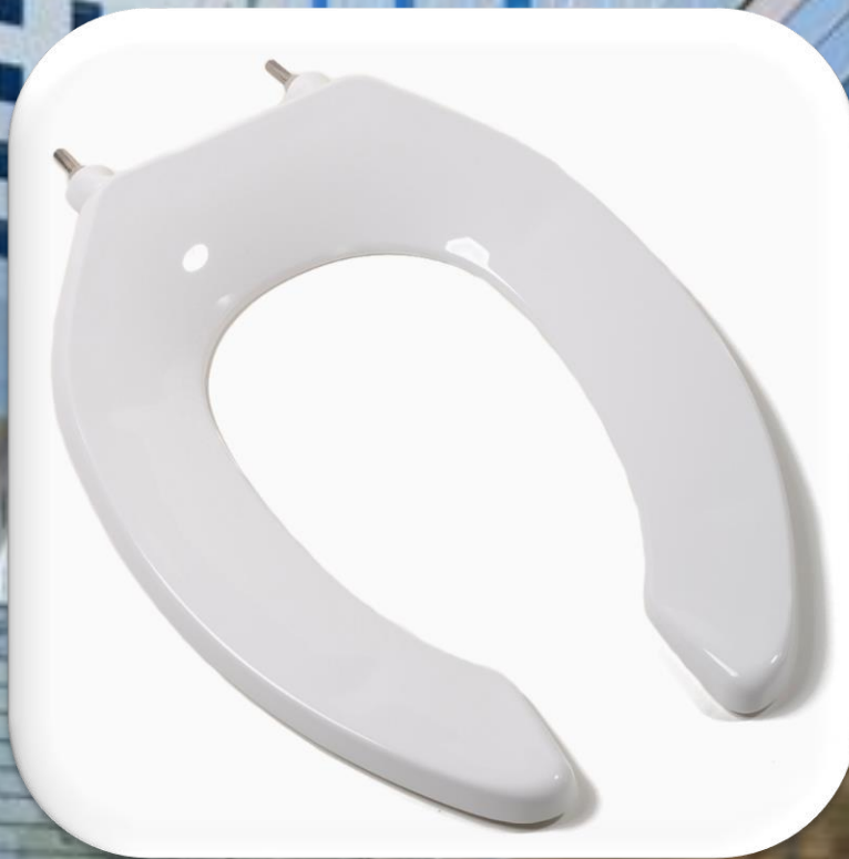
Model 411C Elongated