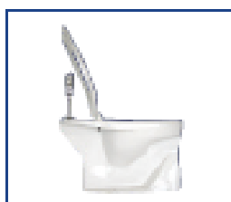
External self sustaining check hinge holds seat 45 degrees before vertical to minimize slamming