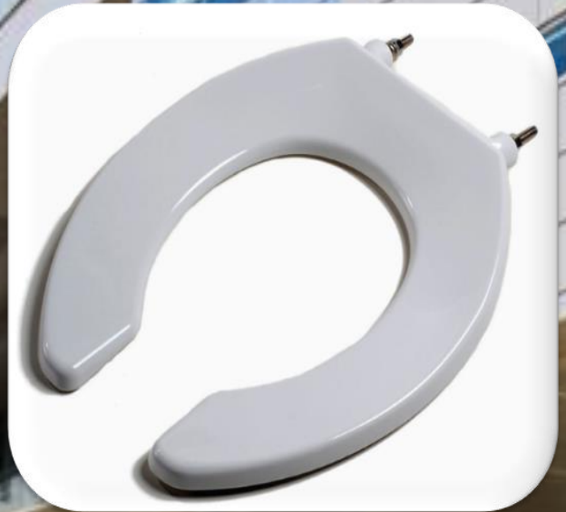
Model 420SSC Round