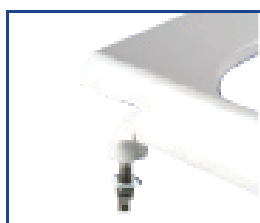
External check hinge with 304 stainless steel hinge posts