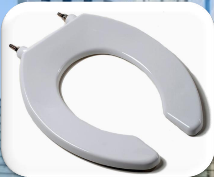
Model 420 Round