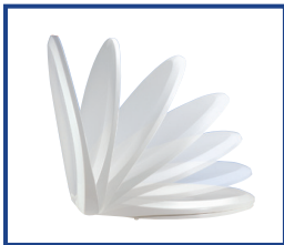
Slow Close Seat