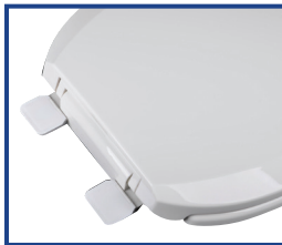
Factory-installed "living" hinge covers