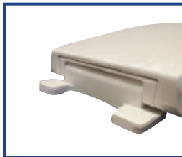
Factory-installed "living" hinge covers with stainless steel screws