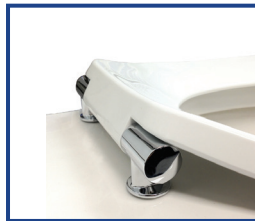
Chrome finish metal slow close hinges